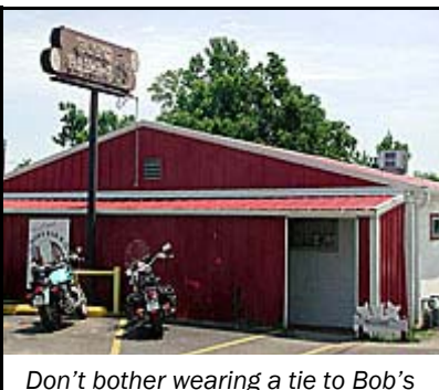
Don't bother wearing a tie to Bob's